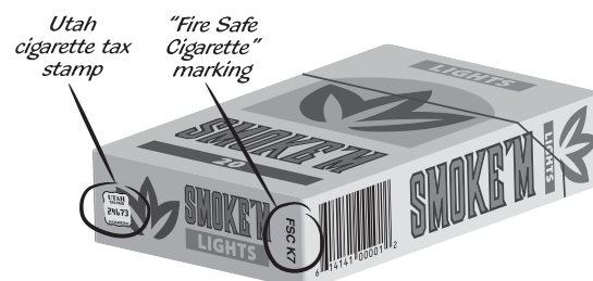
Figure 1: Markings on legal packs of cigarettes

Cigarettes sold in Utah must also be fire-safe (see figure 1 ). The Fire Marshal maintains a list of fire-safe brands online at publicsafety.utah.gov/firemarshal/cigarettes.html .